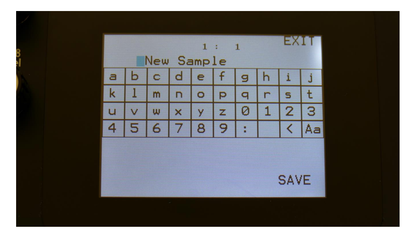
The "<" will move the cursor back, for correcting characters.